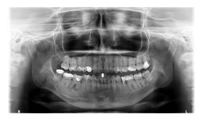
Fig. 1. Panoramic radiograph before the extraction of tooth 35

A 34-year-old female patient was referred to our Private Dental Healthcare (NZOZ, Ka-Dent, Wschowa, Poland) for the extraction of tooth 35 (the World Dental Federation (Fédération Dentaire Internationale – FDI) notation used) and a single-tooth implant treatment after the bone healing period. A lateral panoramic radiograph (CS 9000 3D; Carestream Health, Inc., Rochester, USA) showed failed root canal treatment (RCT) of tooth 35 (Fig. 1). Due to the small percentage of successful conservative approaches, the decision to extract was made and the proce-