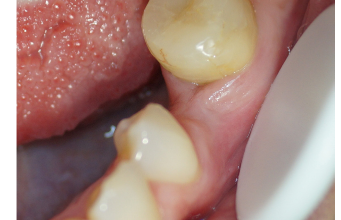
Fig. 7. Healed surgery site 4 months after implantation

A prosthetic impression with a connected impression transfer using an open tray method was taken 2 weeks later, and