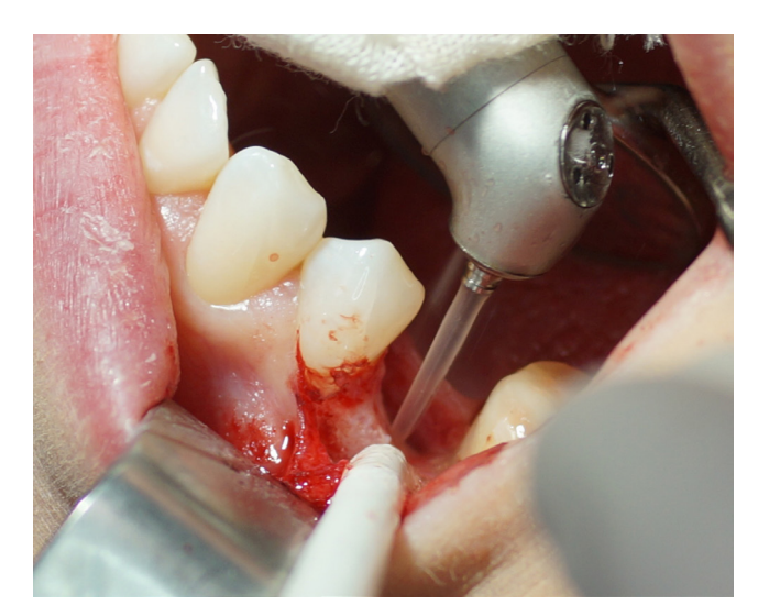
Fig. 3. Implant bed preparation using the Er:YAG laser

Due to photoacoustic phenomena (the cavitation effect) induced while using the Er:YAG system, the implantation site showed decreased bleeding compared to the procedure with bur cutting. The implant was inserted (Fig. 5) and non-absorbable sutures (Dafilon<sup>®</sup> 4.0; B. Braun Melsungen AG, Melsungen, Germany) were used to stabilize the wound edges. Directly after the implantation, the second panoramic radiograph (Fig. 6) was taken, which confirmed the proper implant position in relation to the adjacent teeth. The primary stability measured by means