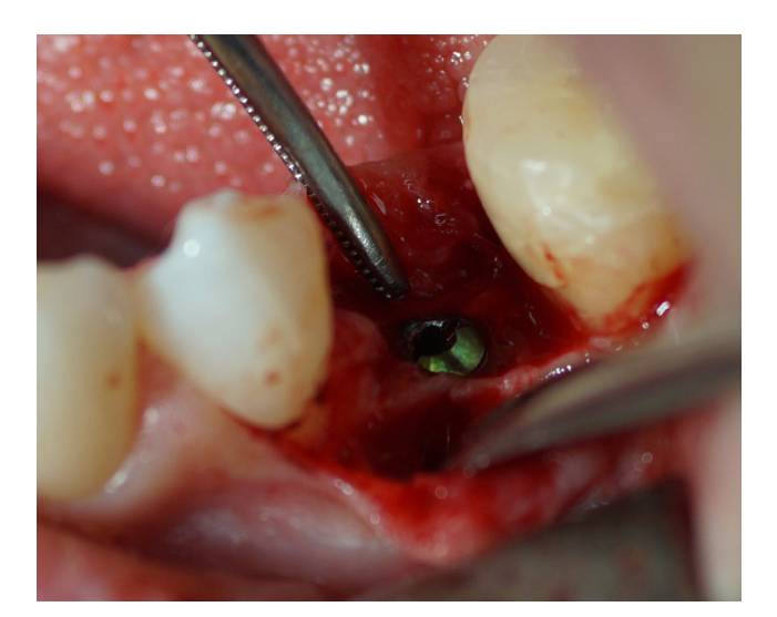
Fig. 5. Surgical site after implant placement