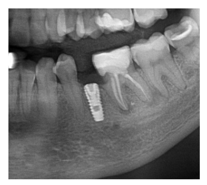
Fig. 6. Panoramic radiograph after implant placement

of the Periotest<sup>®</sup> device (Medizintechnik Gulden e. K., Modautal, Germany) was –3.6 PTV (Periotest value). The sutures were removed after 2 weeks.