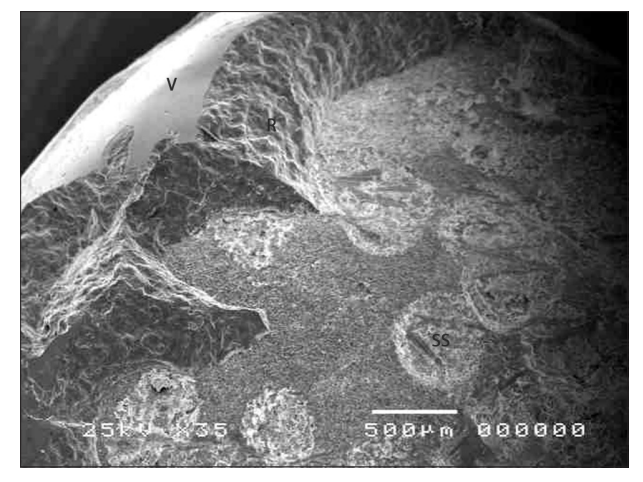
Figure 3: Veneer debonding: Spot size (SS) of about 0.5 mm corresponding approximately to the diameter of the laser sapphire tip

been misplaced and needs to be repositioned, as confirmed by Morford et al. ,<sup>[14]</sup> and the optimization of the used parameters may allow us to obtain this result in the totality of debonding procedures.