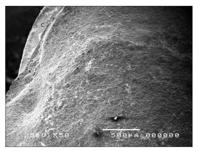
Figure 4: Peripheral preparation with chamfer bur (C) and debonded veneer. The surface is covered with smooth