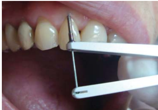
Fig. 2. Clinical examination with Florida probe

2). Investigated parameters were PPD – probing pocket depth, GR – gingival recession, CAL – clinical attachment level and BOP – bleeding on probing, which were measured in 6 points around each included in the study tooth. Plaque presence/absence was recorded at 4 points around the tooth [19, 20].