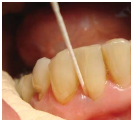
Fig. 3. Microbiological examination

Plaque samples were taken at baseline and one month after therapy from the deepest pocket of each quadrant from 20 randomly selected of all included patients (n = 80). Supragingival plaque was carefully removed using curette or sterile cotton. The selected tooth was isolated with sterile paper roll and sterile paper point was inserted in the pocket ( \varnothing = 50 , ISO) (Fig. 3). After 20-25 seconds the paper points were placed in a transporting plastic box which was delivered from the laboratory (MIP Pharma GmbH, Germany). Microbiological analysis was performed using real time PCR for determination of specific periodontal pathogens in the sample. In the current study only bacteria from the red complex were presented [21] – ( P. Gingivalis – P.g.), Tannerella forsythia ( T. Forsythia – T.f.), Prevotella intermedia ( P. Intermedia – P.i.).