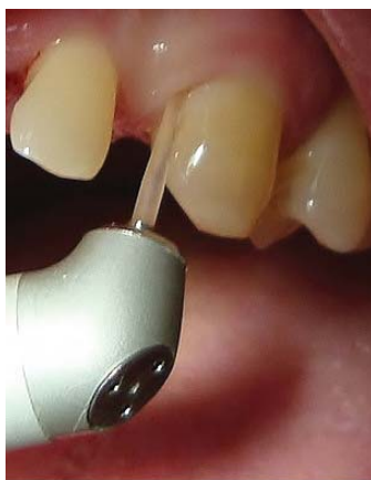
Fig. 1. Root surface debridement with Er:YAG laser

Subgingival instrumentation of root surfaces was performed with Er:YAG laser (Lite Touch, Light Instruments Ltd., Yokneam, Israel) using chisel tip with apico-coronal movements in slight angulation against the root surface (15-20°) in contact hard tissue mode. The panel settings were the following: 100 mJ, 15 Hz, 5-6 water spray level. After that periodontal pocket debridement was performed using tip 0.6 x 17 mm and energy settings: 50 mJ and 30 Hz in non contact soft tissue mode. Instrumentation ended when the operator felt smooth and clean root surface (Fig. 1).