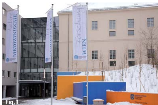
Fig. 1 Bernhard Gottlieb University Clinic of Dentistry, Medical University of Vienna, Austria

As ceramic samples, Cerec®-blocks (VITABLOCS Mark II®), conventional feldspar ceramic were used. We used these CEREC®-blocs because the industrial sintering process under vacuum at 1,170 °C, which can be reproduced at any time, ensures a more homogeneous microstructure with consistent material quality compared to laboratory sintered and lab-processed ceramic restorations. We were thus able to minimize interference factors from the ceramic that otherwise may influence our study results. 16 As adhesive material for gluing the dentin discs on the ceramic blocks we used Variolink® II plus Syntac® (Ivoclar Vivadent,