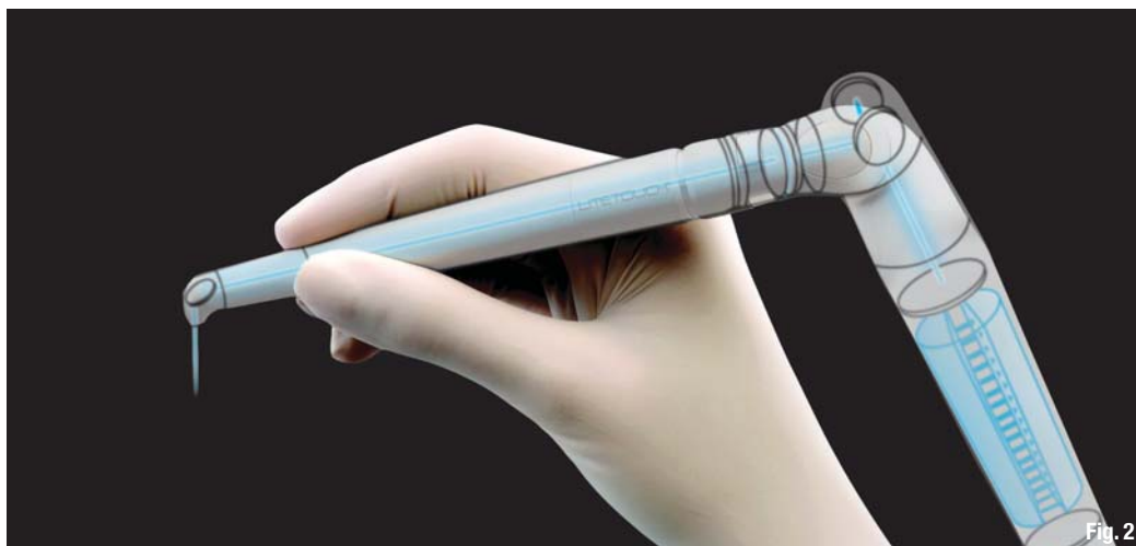
Fig. 2 LiteTouch™ Laser-in-the-Handpiece™: The laser energy is swiftly delivered to the tissue, providing supreme cutting power and precise incisions for hard tissue and bone.

Schaan/Liechtenstein), a classic etch and rinse adhesive system which acts very often as a gold standard.